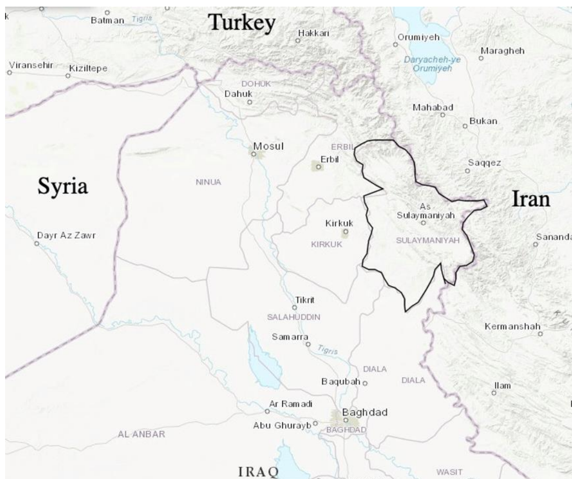
Figure 1: Map of the study area (Sulaymaniyah Province). The map was designed by Landsatlook viewer (USGS Products, Data available from the U.S. Geological Survey). The black line indicates the geographical area of Sulaymaniyah province

EDTA preserved venous blood were randomly collected from 85 staffs and students in the University of Garmian. The collected population samples represent populations of Sulaymaniyah province, Kurdistan Regional Government (KRG) of Iraq. The sample distributions among Sulaymaniyah province are shown in the Supplementary Table 1 . Only Kurdish people, whose family originally descended from Kurdish ancestry, were included in this study. Others with different backgrounds, such as Arabic, were excluded. An informed consent form was filled by each participant and the research was approved by an ethical committee of Department of Biology, College of Education, University of Garmian (Ethical committee No.2: 07/01/2020). The study was conducted in accordance with the Declaration of Helsinki. The collected blood samples were kept in a refrigerator until total genomic DNA were extracted. This study was conducted in April 2019 and its geographical area is shown in Fig. 1.